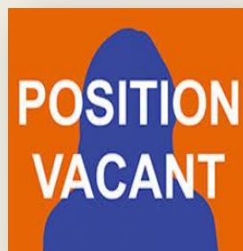
UNIFORM COORDINATOR: Vacant