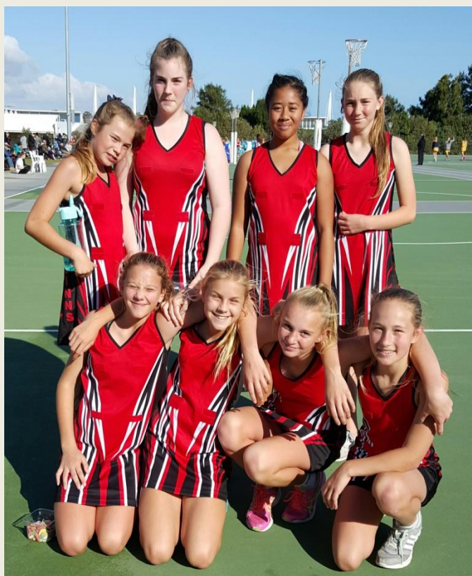
Top left: 12U Pearls