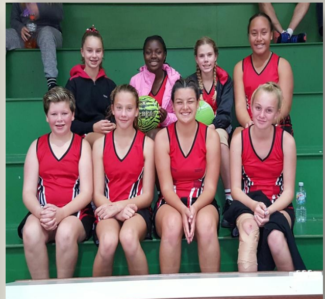
Top left: 12s Team, Gin Gin Carnival